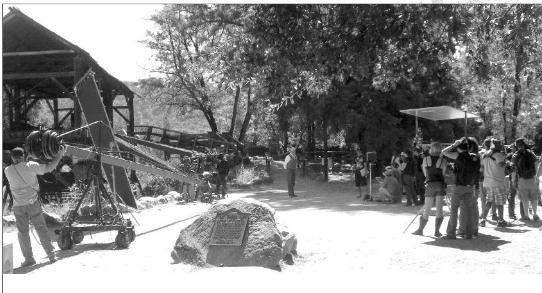
A Reality TV Pilot films their host at Marshall Gold Discovery Park

To issue all those permits, it takes the cooperation and time of numerous agencies and it's really a testimony to the way departments from all ends of our county pull together to make things happen. Special thanks go out to The El Dorado National Forest, U.S. Forest Service Lake Tahoe Basin