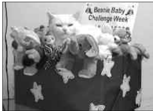
If you've stopped by the Chamber within the last 11 years, you may have made the acquaintance of Mason, the Chamber cat. Sadly, the Chamber staff wishes to let Mason's friends know that he passed on in December. This picture of him is during our collection several years ago for Beanie Babies to send to the troops.